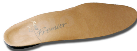
Extension to the sulcus or the toes is available at an additional charge.